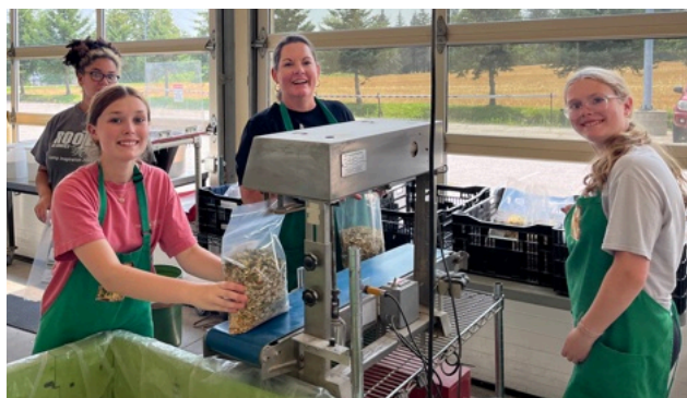
Youth from First Baptist Church, Missouri

The next requests of food are scheduled to go to Burkina Faso, Ethiopia, Philippines, Ukraine, Cuba, Haiti and Guyana.