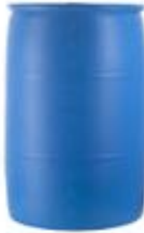
Used Drums and Pails Shipping Veggie Mix $45 - $60/skid (60 pails or 4 drums)