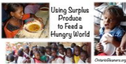
Telling our Story in the Building (inspirational picture boards to hang in our trimming room) $200 each