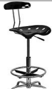
Adjustable Stools $115 (10 needed)