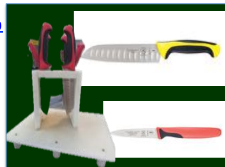
Large Knives $33 (12 needed) Small Knives $10 (20 needed) Knife Blocks $15 (3 needed) Cutting Boards $15 (60 needed)