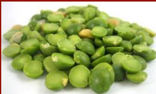
Peas by the metric ton $425 ($20/100 lbs)

By Credit Card: Gleaners Office: 519.624.8245 Online: www.OntarioGleaners.org/1290