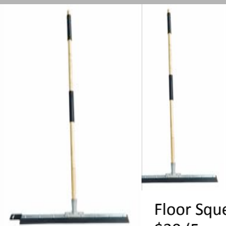
Floor Squeegees $30 (5 needed)