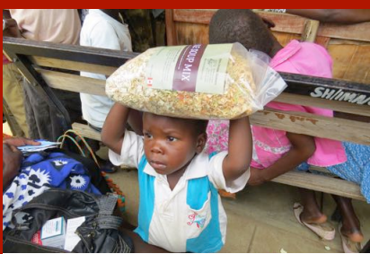
Feeding Hungry Children $8/bag (production cost, feeds up to 100)