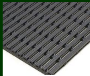
Non-slip Floor Mats (6 needed) $60 (for two volunteers to stand on)