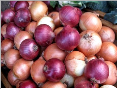
6 lbs Dried Onions (2000lbs needed) $20