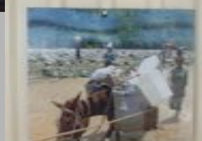
Enhancement of the Solarium Workspace – lighting/pictures $250