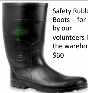
Safety Rubber Boots - for use by our volunteers in the warehouse $60