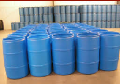
Plastic Barrels for shipping soup (120 needed) $15

By Mail or at our building: Ontario Christian Gleaners 1550 Morrison Rd. Cambridge, ON N1R 5S2