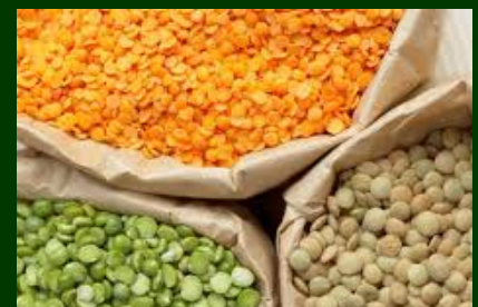
25 lbs Lentils (2000lbs needed) $15