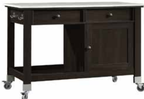
Display Table in Welcome Area – for tours and new volunteers $500