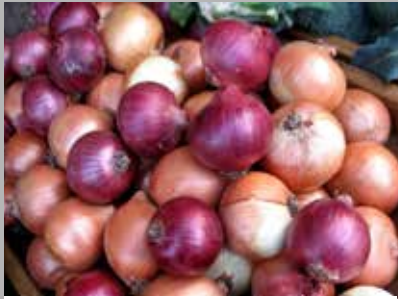
5 lbs Dried Onions (2000lbs needed) $10