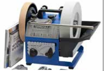
Knife Sharpener – for our bi-weekly knife sharpening $1000