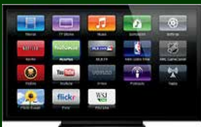
Display screen – for trimming room for training & instruction $800