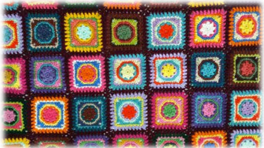
Green Baby/Child's Afghan (approx. 24"x31" or 60x79cm)