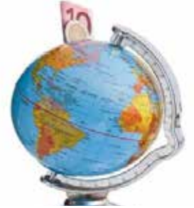
World Money Bank – for donations $200

These items will help us in our daily work of processing surplus vegetables and fruit to make nutritious soup mixes and fruit snacks for distribution to needy people in countries around the world.